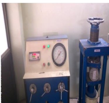
Fig.1 Fig.2 Fig.3