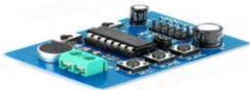
Fig3:Voice Playback Module

This module use is simple which you could coordinate control by push button ready or by Microcontroller, for example, Arduino, STM32, Chip Kit and so forth. From these, you can simple control record, playback and rehash, etc.