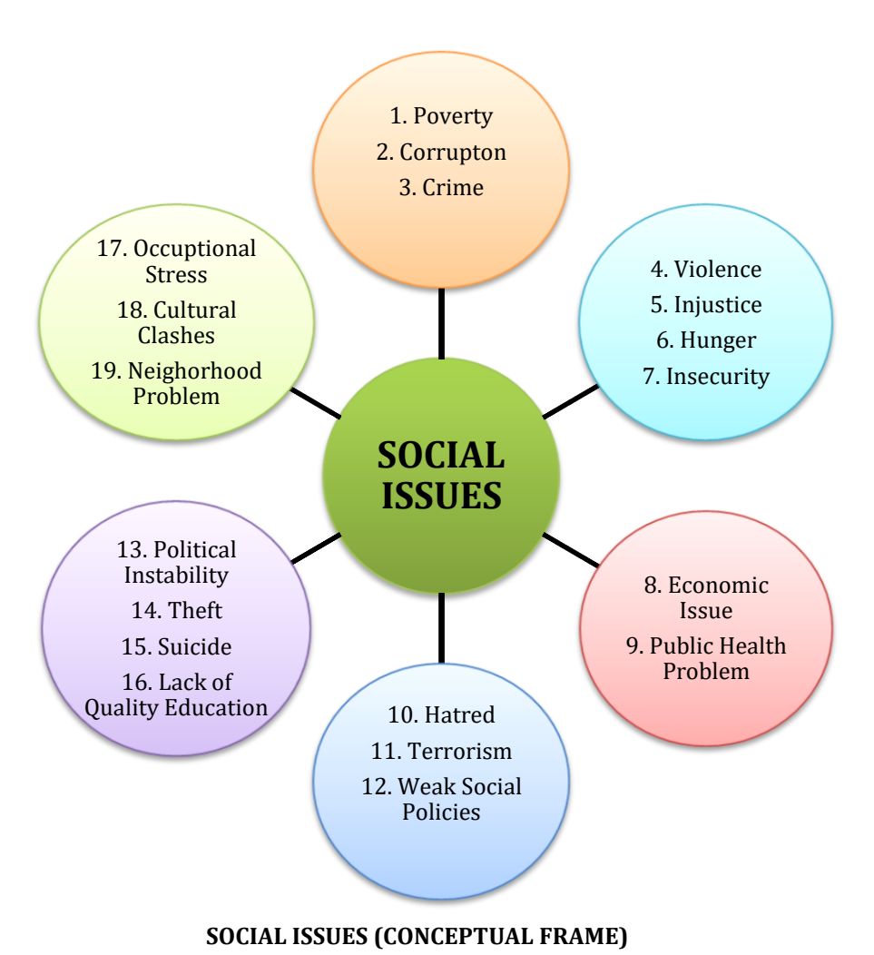
II. STATEMENT OF THE PROBLEM

Social issues badly influence students from their psychological, physical, mental, economic, cultural and personal perspectives while living in society. Therefore, research over it is the need of the day, therefore,