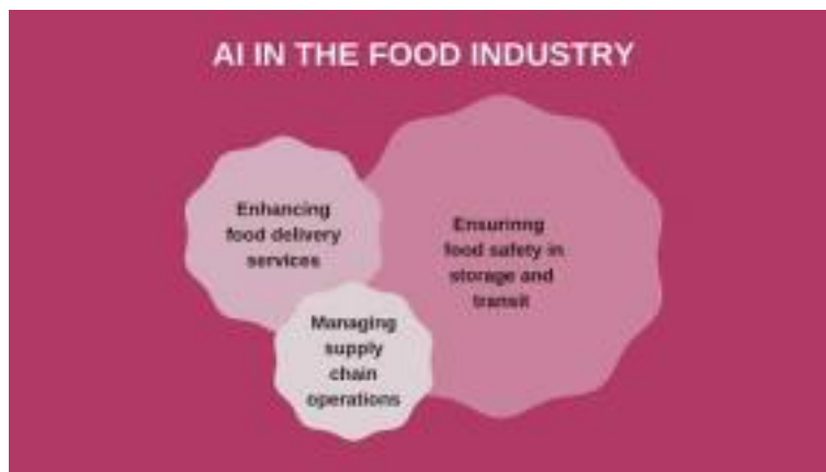
Figure 3. AI in the food industry

Sanitary standards have been tightened as a result of the FSMA (Food Safety Modernization Act), taking the entire supply chain into account. Spices, cereals, and other non-perishable foods need to be refrigerated are now at risk of infection, which is the cause. Such goods weren't previously prone to infection, but that has changed lately .