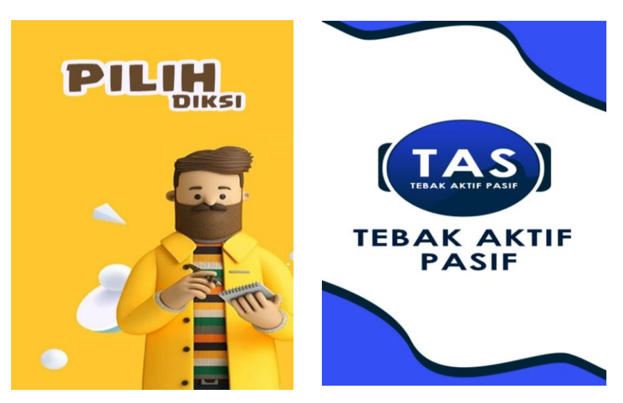
Figure 2. Game Cover View

On the start screen of each game, there is a Start page and page Finish. On the next page, there is a game level menu. When you play for the first time, there is only one level that appears, namely Level 1. However, if the user has played more than once and has completed all the levels, the three levels will appear on this page. On every game page there is also a button Back. When finished answering, the information will immediately appear Correct or Incorrect on the user's answer choices.