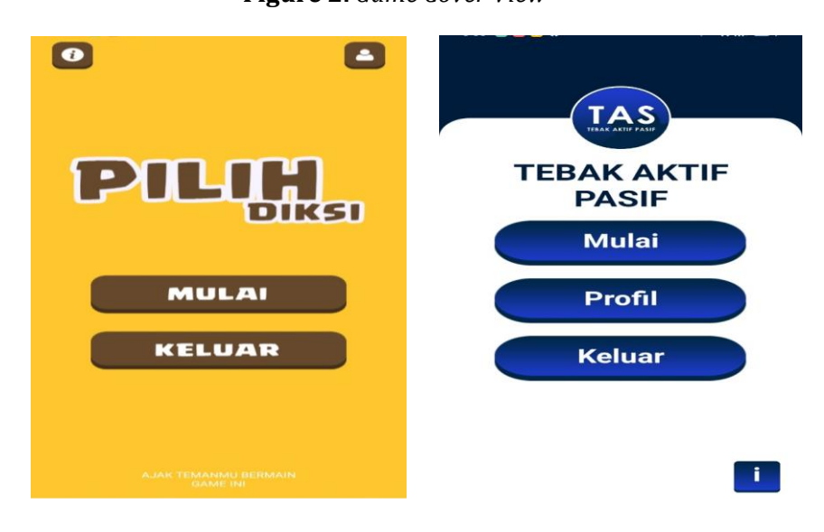
Figure 3. Game Start Page View