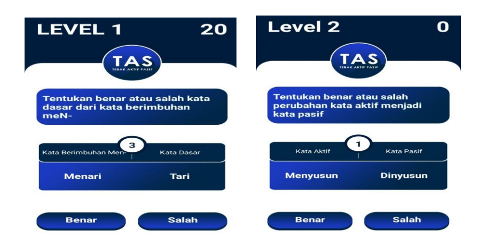
Figure 6. Contents Page Display of Tebak Aktif-Pasif Game

In both the games Pilih Diksi and Tebak Aktif-Pasif, for each correct answer, the user will get a score of 10. The game at a higher level is locked so that if the player wants to play at that level, the player must be able to complete (answer correctly) all the questions in the game previous level.