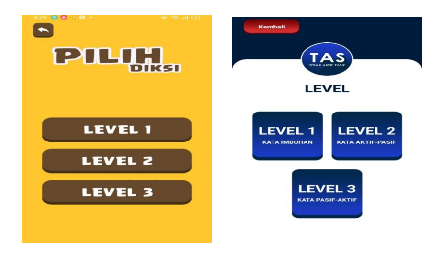
Figure 4. Game Level Page View

The game Pilih Diksi consists of three levels with different difficulty levels: the more the level, the more the difficulty level. In this game, words with similar language sounds are presented. Then, players are asked to choose the right words according to the context presented. At level 1, two words that contain similar sounds and pictures are presented. Then, the user is asked to determine the right words according to the image presented. At level 2, two words are presented that contain similar sounds in a sentence context. Then, the user is asked to choose the right word according to the context of the sentence. At level 3, 12 different words are presented. Then, the user is asked to look for words that are similar from the twelve words in the table.