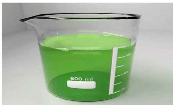
Fig. 1: Herbal Mouthwash Formulation