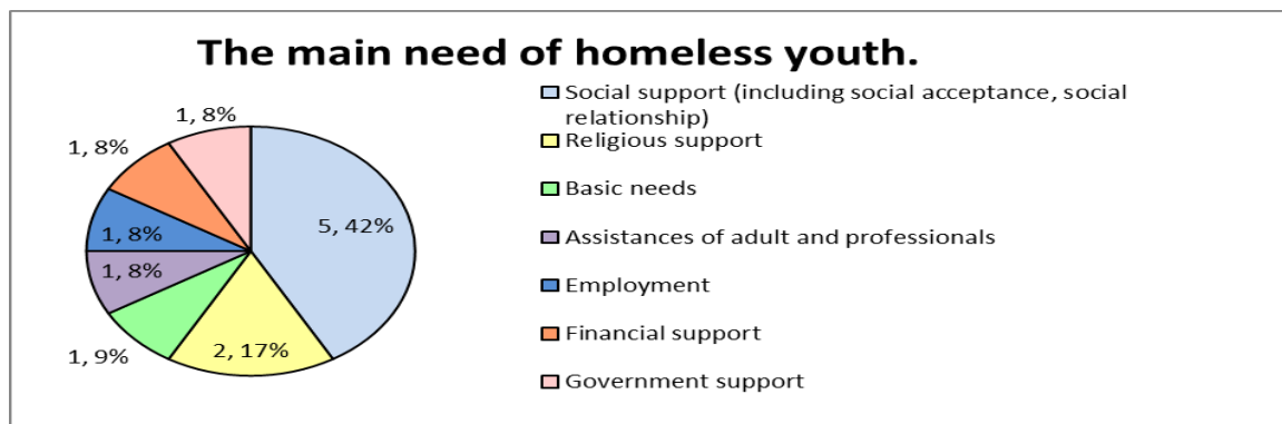
Figure 4: The Main Need of Homeless Youth

According to the information provided by the participants as shown in figure 4, the researcher found social support is the main need of homeless youth in the perspectives of community. Five participants (42%) agreed that social support including social relationship and social acceptance is needed by the homeless population. There are two participants (17%) claimed that religious support is the main need of homeless youth. There is one participant stated that assistances from adult and professional are needed by the homeless youth; one participant claimed that financial support is important. Other than that, one participant thought employment is the main need of homeless youth while one participant stated that basic needs of living is necessary for the homeless population. There is only one participant claimed that government support is the main need of homeless youth.