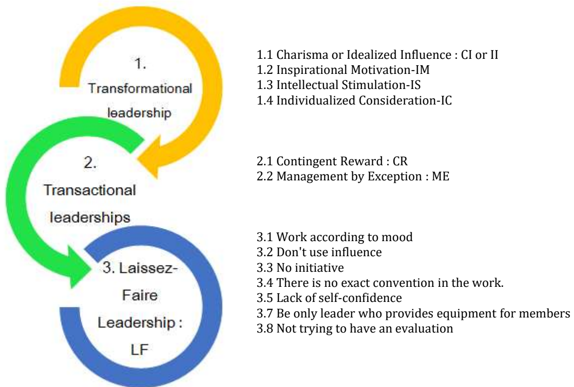
Figure 2: The concept of complete range leadership (Synthesized by the author)