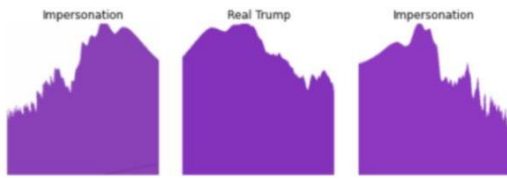
Figure 8.1 Dataset collection