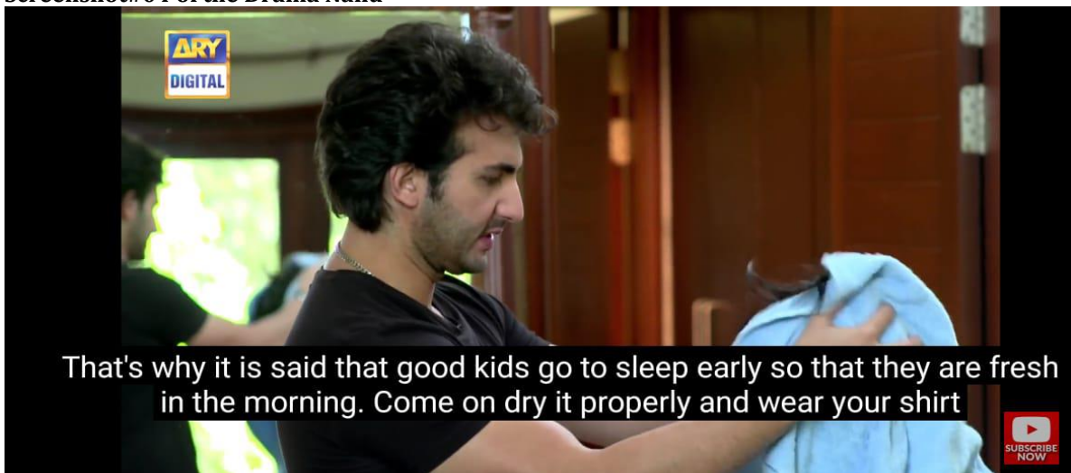
Screenshot#04 of the Drama Nand

In the above screenshot#03, it has been observed that “ Rabbi ” is preparing breakfast in the kitchen for “ Umer ” which is the responsibility of Umer’s mother Gohar. But Gohar is habitual of waking up late, and Rabbi always prepares breakfast for Umer as well as lunch box in the morning, and at that time no one in the kitchen helps Rabbi. And this depicts that the female gender other than the particular gender of Gohar has a soft corner for other relatives and relations. In the whole drama, the protagonist is depicted always by giving only orders and commands to the other characters, and she also creates illusions in the relation of Rabbi and Saqib. Rabbi always gives sacrifices to save her matrimonial relations with Saqib because Gohar being married and a mother of one child living at her mother’s home which is against the norms and tradition of Pakistani society. The thing which makes the Gohar character hatred that she always indulging in the matters of other’s lives and the middle of the drama, Gohar succeeds and Rabbi is divorced by Saqib.