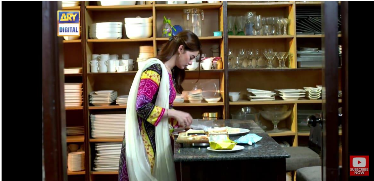
Screenshot#03 of the drama Nand