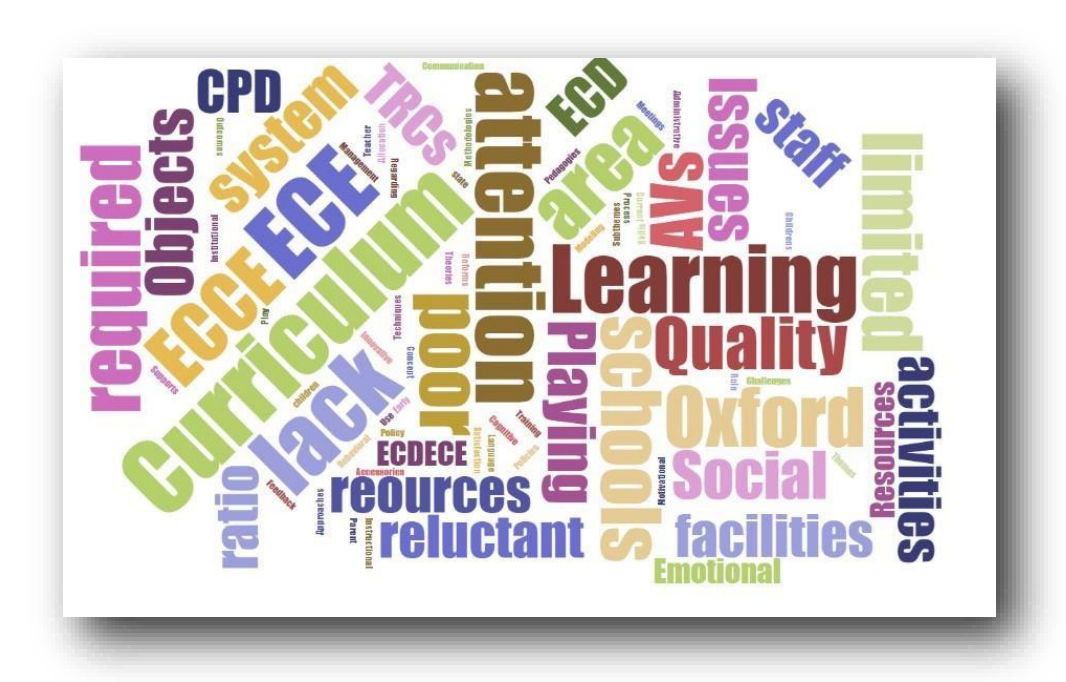
Figure 2. word cloud based on teachers (public & private) views

vision of SDGs (target 4.2). Government of Pakistan took interest in ECD and ECE to achieve SDGs. While the progress and implementation regarding ECD and ECE are less competent as it demands (Arshad & Zamir, 2018; Idara-e-Taleem-o-Aagahi (ITA), 2019; Situation Analysis of Children in Pakistan, 2017). Pakistan is still struggling to achieve education for all (EFA) targets. The observational data demonstrate that public schools are less focused on ECE interaction domain (emotional support, classroom organization, and instructional support (figure 1). The administration of publics schools takes less attention and untrained to deal with ECD/ECE (Hussain, 2018). The practices of teachers regarding quality ECE to children are less satisfied in comparison to private sectors (Ghumman & Khalid, 2016).