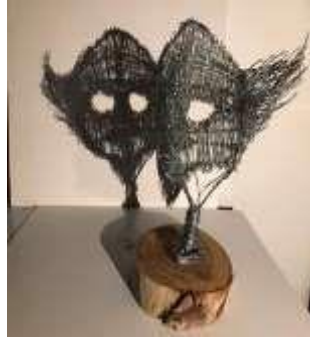
pic (16) The shadow of mask