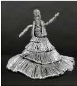
pic (1) Tanoura

Metal wire was used in several sizes, thin and thick, in the project, in black and silver colors and paper for printing the poster. See pic (6)