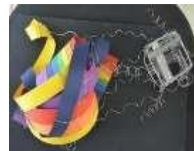
pic (17) Front view of The envy blue eye