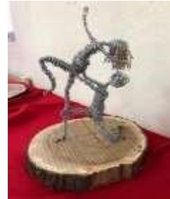
pic (3) Dancers