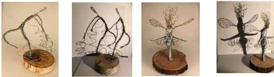
pic (11) Dream in freedom

Two colors were used, the first was the silver wire used to create the mask face, while the natural wood was used to create the base, Nails were used to hold the mask on the wooden base.