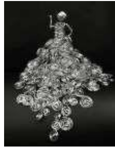
pic (2) wedding dress