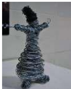
) Tanoura sufi 5pic ( Dancer pic (6) poster of the sufi dancer pic (4) mother and son dancing