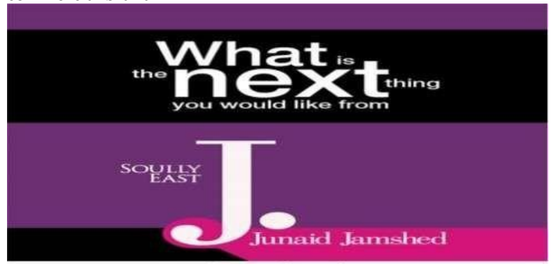
Let us know!

To analyze J's strategic use of cultural imagery and linguistic adaptation, the following data was obtained from the official website and Facebook page the brand. A special focus has been given to the linguistic and semiotics characteristics used in the text. It is significant to mention that Junaid Jamshed, the founder of the brand was a well-knownPakistani rockband leader beforehis transformation into a religious scholar.Hencereligious elements are often prominent in the textual features of promotions used by this commercial brand.