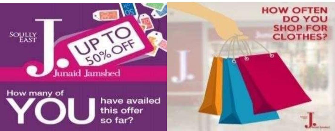
Figure (4.1.2) Figure (4.1.3)

Fairclough (2014) examines the different rhetorical pruposes achieved through the usae of personal pronouns in advertisements.Relationalvalues implicitincaptionsemphasizesanalyzing the choice of phrases that have an impact on how the audience react to the text. Through usage of pronouns like'you', 'we', 'your',etc.,a certain relational meaning is implied in the language of ads. These pronouns are used in the discourse of "J." advertisements to speak with clients directly, demonstrating engagement and offering company thusgiving its customers a feeling of friendly or even familial relation. Consider the following figures as an example: