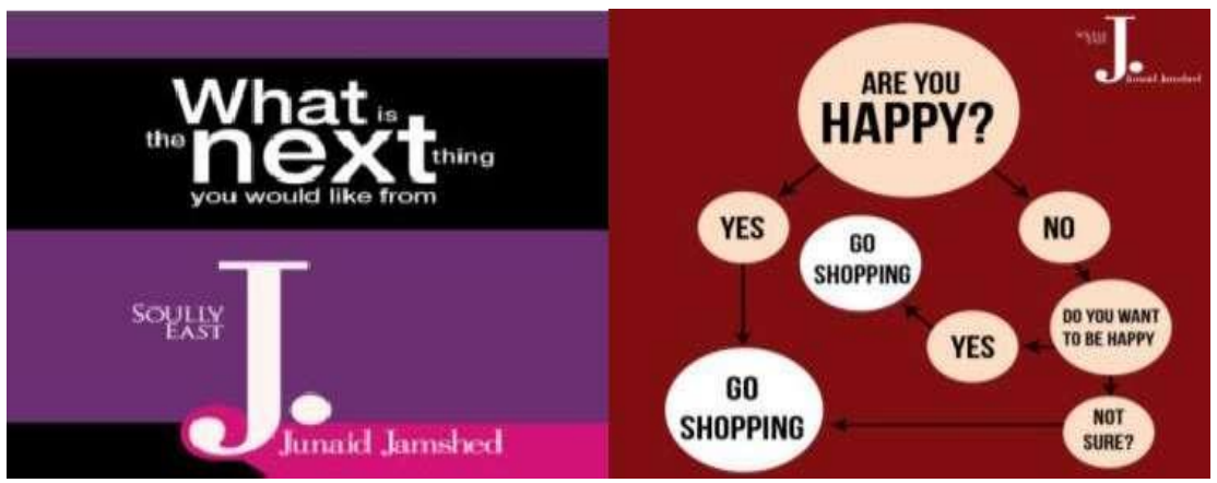
Figure (4.1.4) Figure (4.1.5)

The above data illustrate rhetorical strategies 'J' uses to personalize its relation to costumers. To create a congenial bonding with the costumers, they are invited in into the decision making processes of the brand. The following section illustrate other rhetorical strategies that National Foods Limited uses to achieve commercial objectives and establish brand identity.