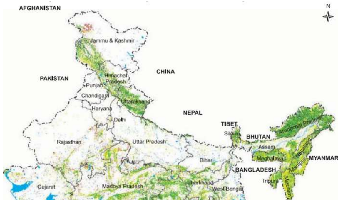
Fig 2. Forest Cover map of Himalayan states of India