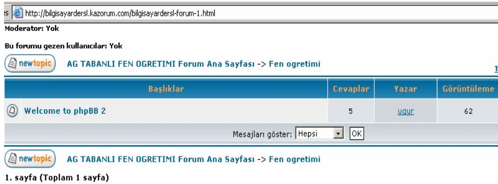
FIGURE 3. Forum Page where messages from all users can be seen

Communication: It is the area where students can reach their answers when they want to mail the teacher to the forum page in Figure 3 and the questions in the evaluation section, which was created in order to communicate with each other and with the teacher.