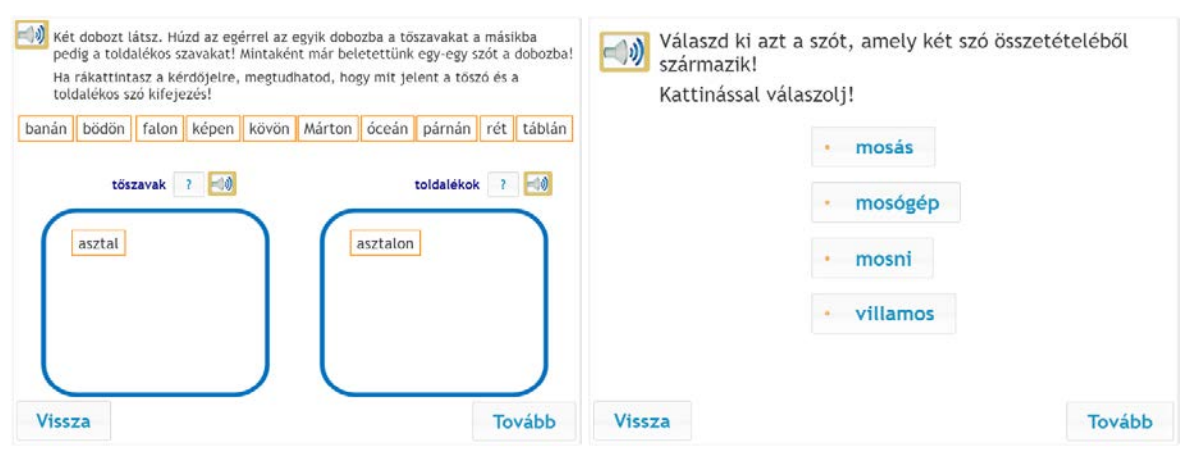
FIGURE 1. Sample items for affix identification (real words) and compounds

The second subtest included compound nouns. Children chose the compound nouns from four words (Figure 1, right), the instruction said: "Choose the compound word which is made up of two words. Answer by clicking on the correct word. " All the four words had the same base word (mos - "wash"; mosás- "washing"; mosógép - "washing machine"; mosni- "to wash", villamos - "tram"). Six items out of ten contained pseudo-compounds like villamos-"tram". These words contained two simple words inside them but still, they were not compound words because their meaning separately had nothing to do with the meaning of the word. (villa - "villa" or "fork"; mos - "wash"; villamos - "tram").