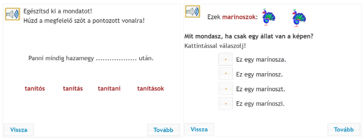
FIGURE 2. Sample items for derivation and identification of affixes for nonword exercises

The fourth subtest contained nonwords testing identification of affixes using nonwords to which real affixes were attached (Apel et al., 2013; Berko, 1958). Identification of affixes of singular and plural nouns, present and past of frequent verbs, and objective and instrumental cases of nouns were assessed. Two types of tasks were given. Either a question had to be answered by clicking on the correct sentence, or the correct sentence had to be selected from the four choices (Figure 2, right). In the nonword task, children got the following information: "These are marinoszes. What do you say if there is only one animal in the picture? Answer by clicking. a) It is a marinosza., b) It is a marinosz., c) It is a marinoszt d)It is a marinoszi."