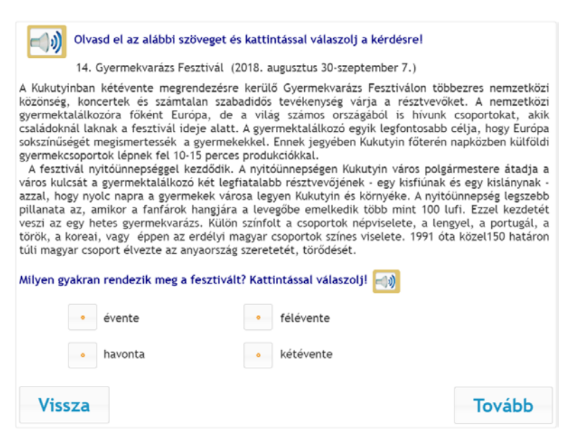
FIGURE 3. The item from the reading comprehension subtest

test, children could work on their own. Scores were anonymous as they were attached to the identification code rather than a student's name. Parental consent was asked from the parents, and only the students whose parents granted consent participated in the experiment.