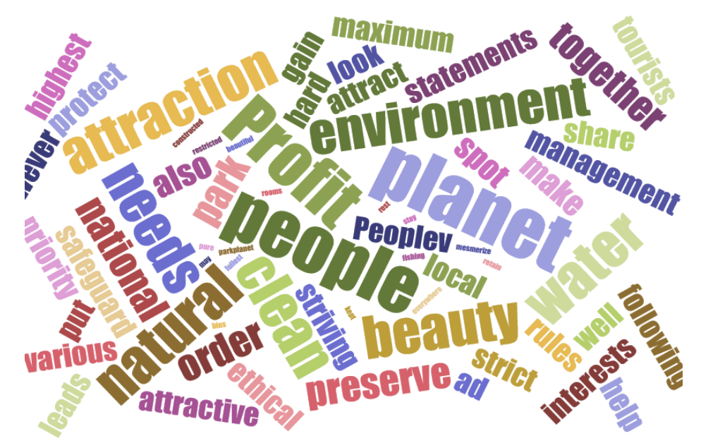
Figure 1: Word Cloud of Saif- ul- Maluk National Park