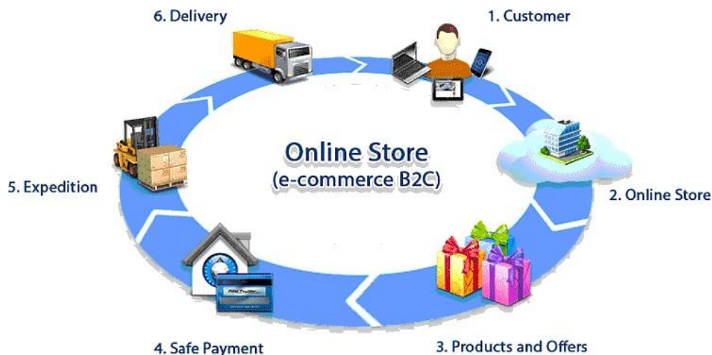
Fig 2: E-Commerce selling process