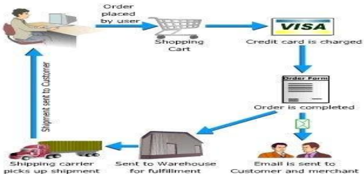
Fig 1: E-Commerce transaction cycle

such as Flipkart, Amazon, and Myntra, where people can quickly purchase their required things. These websites allow people to buy their products while remaining at home. Finally, we are able to see a difference in product prices, like after we see that the value of a product is slightly more in offline buying compared to online purchasing because it can help us create the foremost effective and powerful web applications, front-end are going to be the simplest option for building these styles of E-commerce web apps. E-commerce is described as the purchasing and promoting of items and services over a digital network, most many times the internet, as nicely as cash and facts transfers (electronic commerce).