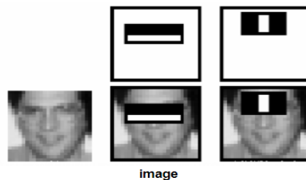
Fig 3. Haar Features

Haar classifier cascades first are trained. In order to train the classifiers, this gentle AdaBoost algorithm and Haar feature algorithms must be implemented. Fortunately, Intel developed an open source library devoted to easing the implementation of computer vision related programs called Open Computer Vision Library (OpenCV). The OpenCV library is designed to be used in conjunction with applications that pertain to the field of HCI, robotics, biometrics, image processing, and other areas where visualization is important and includes an implementation of Haar classifier detection and training. Thus with help of this algorithm system will detect the person's face in the video. Face of the person gets Green Square as an indication of detection process. As soon as the face gets detected user can paused the video and enters the data of detected person such as person's name, address, profession, criminal record if any. If the detected person has criminal record then it can be defined as suspect. Check box option is given in the system where user can tick whether the person is suspect or not. This is the working of first module in which sample video is browsed and face is detected.